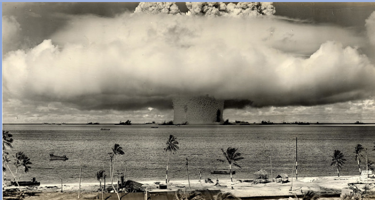
Atomic test at Bikini Atoll in 1946.